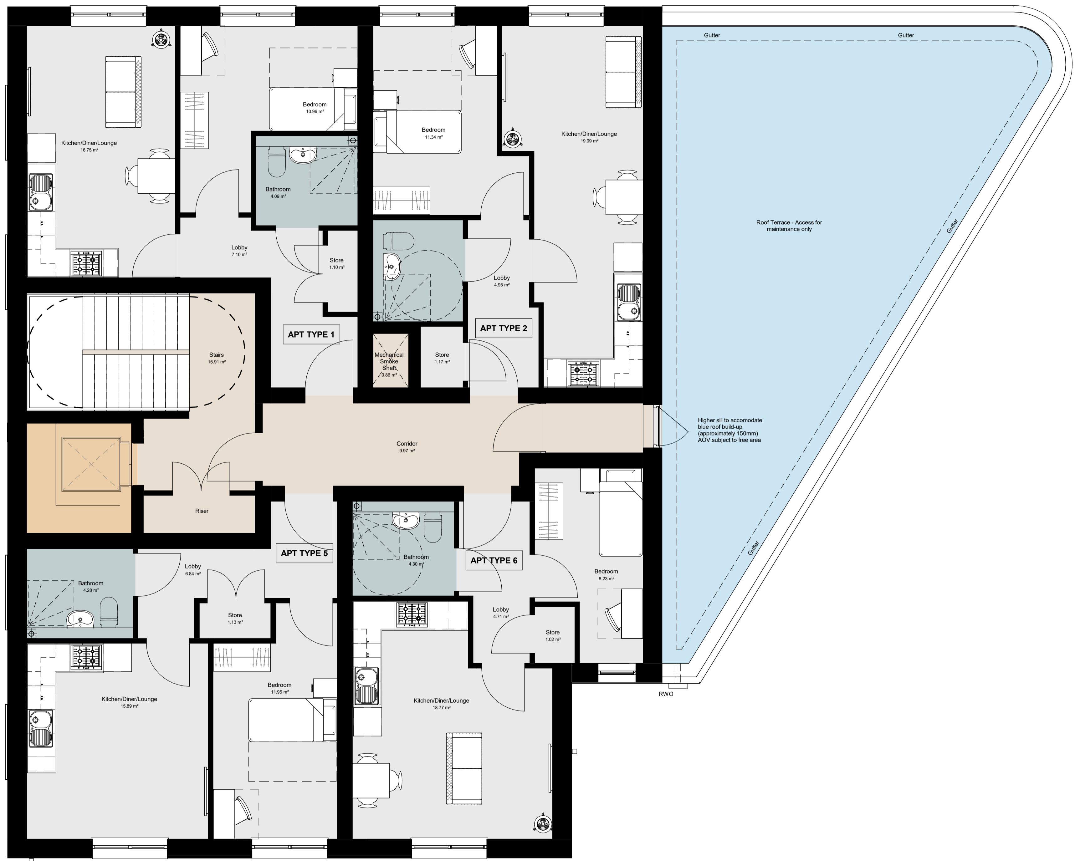
Proposed 04 Fourth Floor - Blue Roof Scale @ 1 : 50